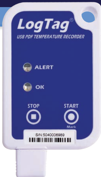
Rated Absolute Accuracy